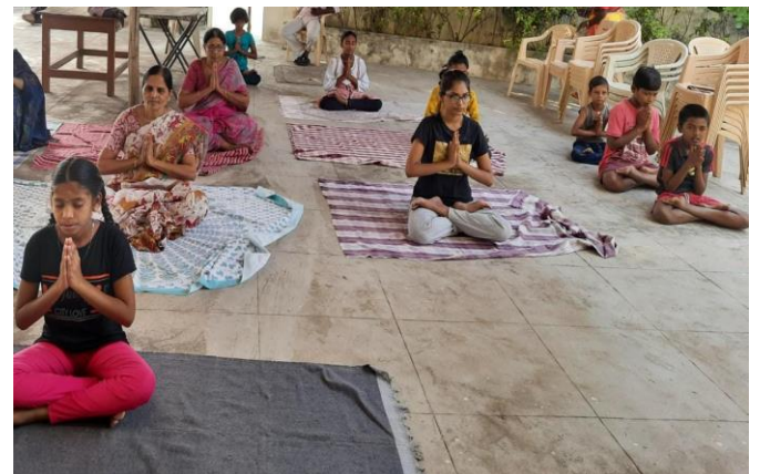
Yoga Session ended with Shanti Mantra