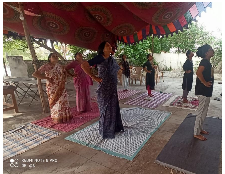
Images of Yoga session