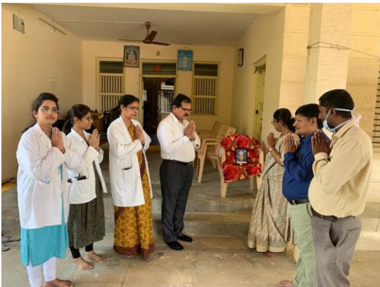
LORD DHANWANTARI POOJA