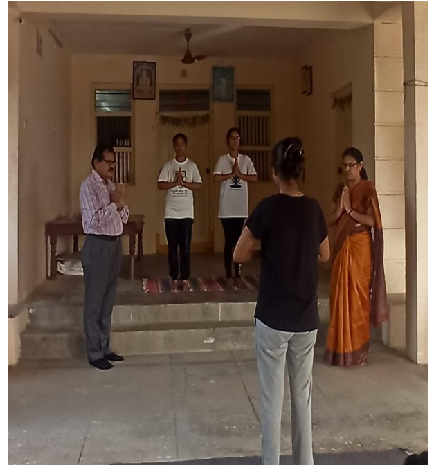
Yoga session started with Pathanjali prayer & Lord Dhanwantari prayer