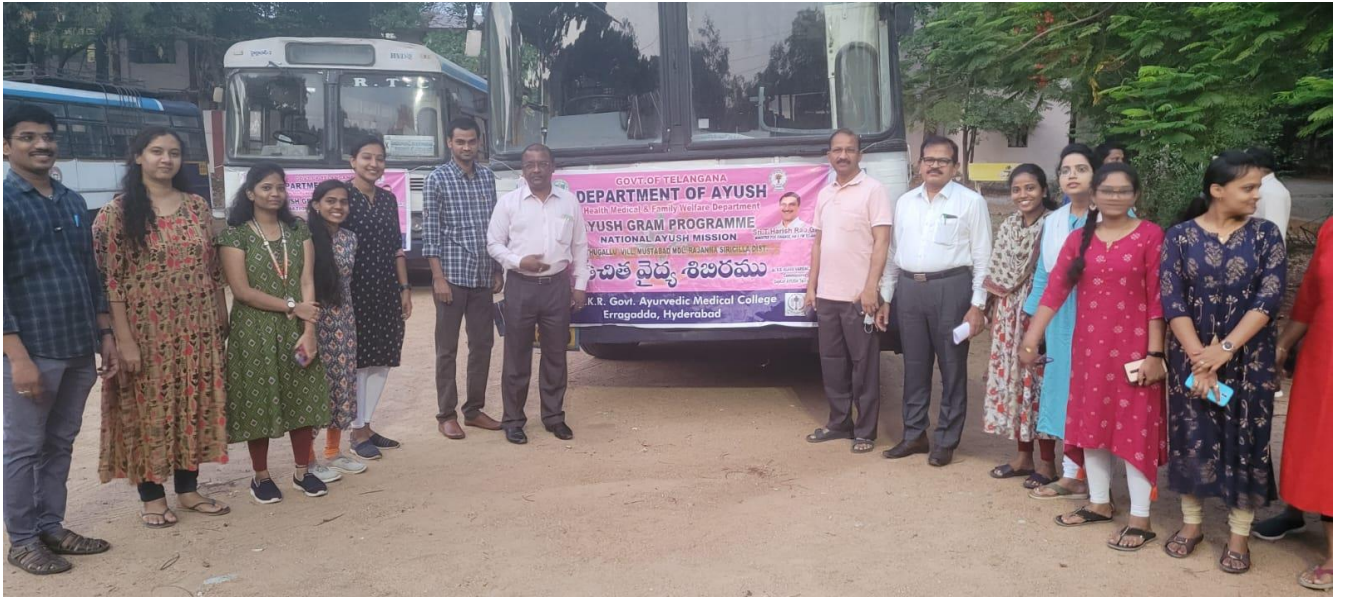
AYUSH GRAM PROGRAMME Team started towards Pothugallu