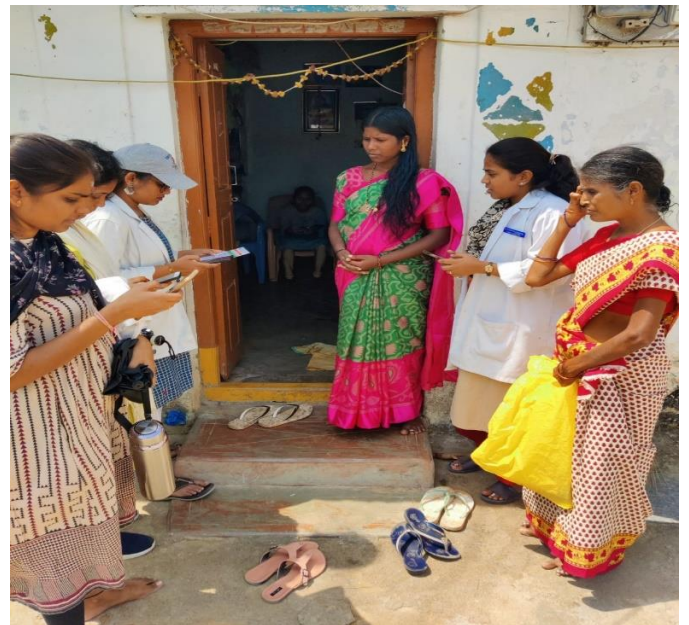
House hold Health survey