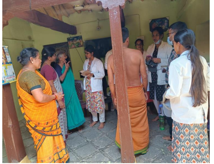
House hold health survey