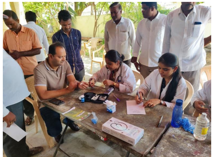
Collection of Blood Sample for Hb% / GRBS