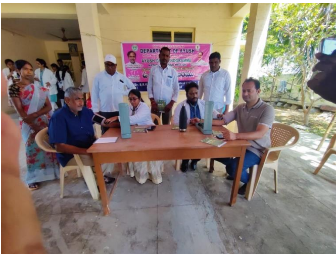
Medical camp – Faculty examining the patients